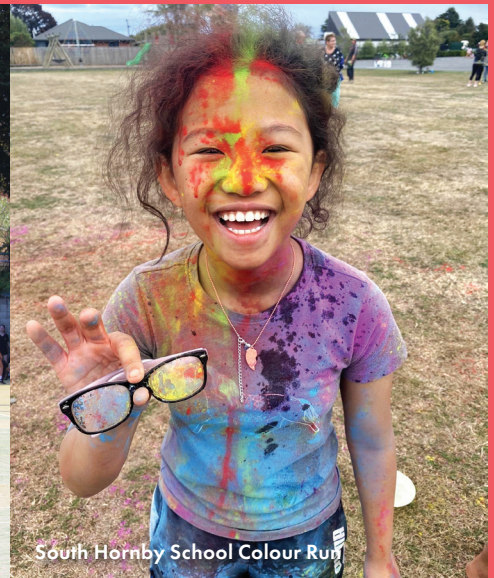
South Hornby School Colour Run